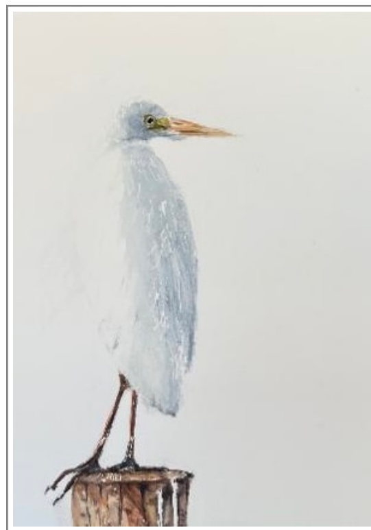
Strikes a Pose