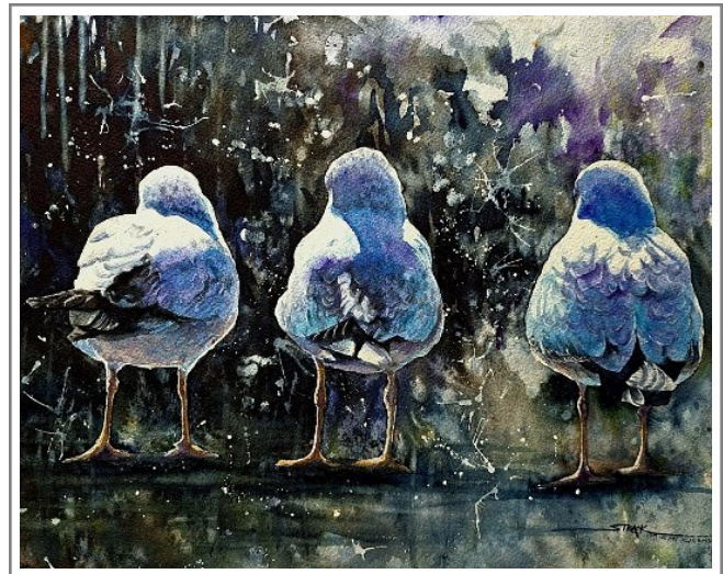
Into the Darkness