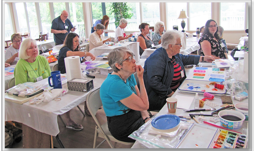
Yupo 1 workshop

In 2015, DWS obtained nonprofit status. From 2015 to 2019, we continued our activities, meetings, and workshops at the Glade clubhouse. That ended with the beginning of Covid and since then we have not had any in-person meetings. The society has continued to provide workshops via Zoom and in-person exhibitions each year.