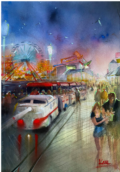
"Make Way For The Trolley"