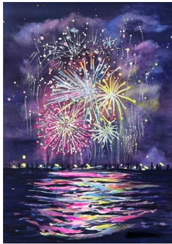
MERIT AWARD "Grand Finale" Kym Bellerose