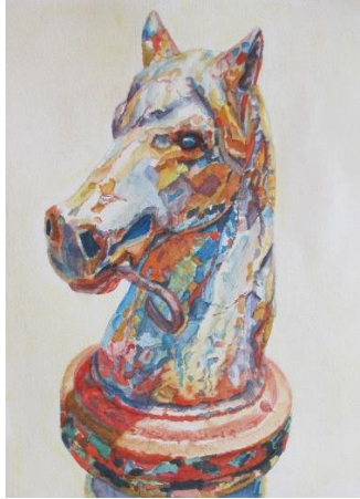
“The Hitching Post on Bourbon Street, NOLA” Anne Crown-Cyr

the Springfield Art Museum, 111 E Brookside Drive, Springfield, MO 65807. For more information and to see the list of participating painters go to www.sgfmuseum.org/246/Watercolor-USA .