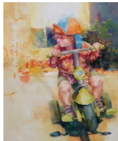
We Are Stardust Robin Poteet