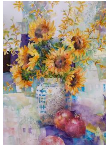
In Full Bloom Robin Poteet

You may view Robin Poteet’s work on her website at robinpoteet.com .