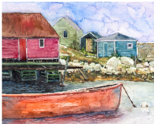
"Low Tide at Peggy's Cover" Third Place Award Kathleen Cropper