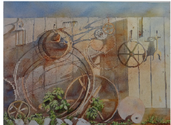
"The Blacksmith's Fence" Second Place Award Isabel Pizzolato