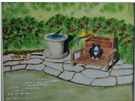
"Mickey's Garden" - Phyllis Zwarych