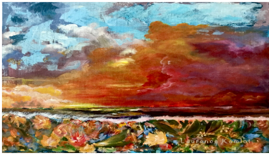
"Sunset" - Larry Kamlot