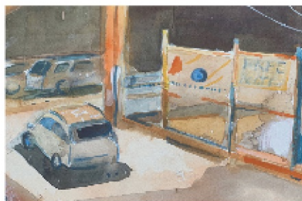
"Night Parking" - Angela Herbert-Hodges

Those who participated were entered into a drawing for a Dick Blick gift card. Congratulations to Phyllis Zwarych our lucky winner..