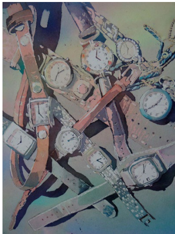
"Time Keepers" Isabel Pizzolato