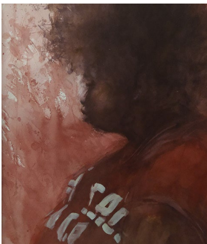
"Working at Spencer's Auction" Winifred Way