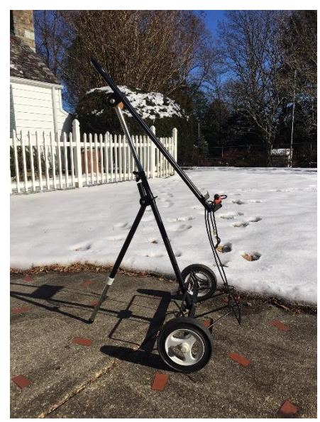
Artbin "Wheasel" $20