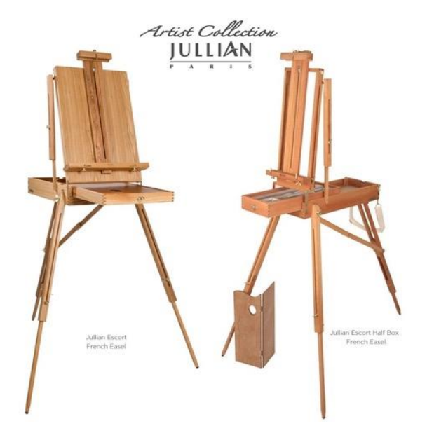
Jullian half-box easel $95