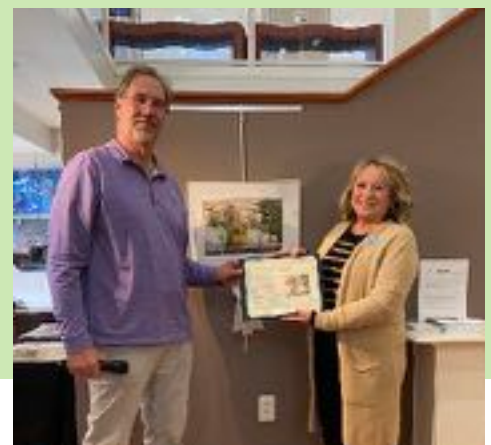
Third Place: Pumpkin Party by Kathleen Cropper