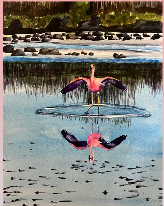
Flapping Flamingos-Galapagos by Cynthia Strouse