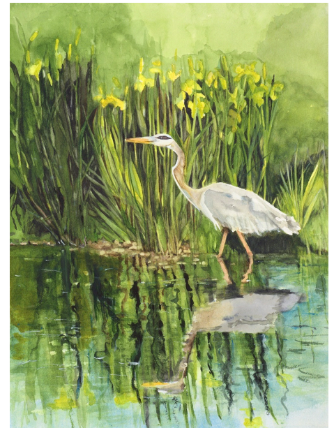
Blue Heron by Kathleen Cropper