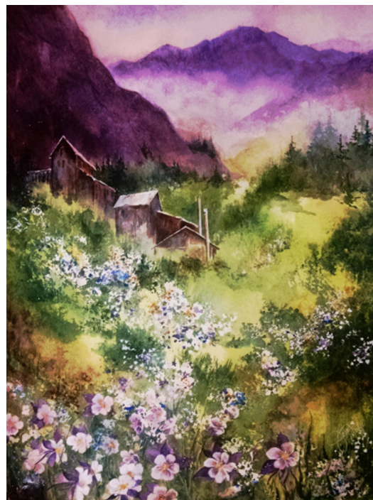
“Colorado High Country” -Joan Judge