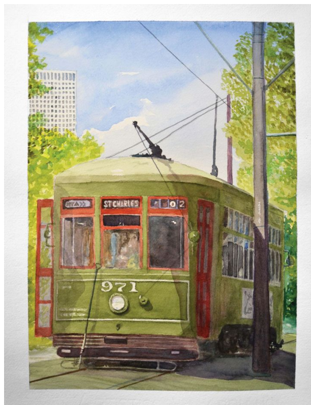
“One Canal” -Brad Hastings