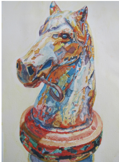
“The Hitching Post, New Orleans” by Anne Crown Cyr

Anne Crown Cyr's painting, The Hitching Post, New Orleans , will be on display at the Rhode Island Watercolor Society's National Water-media Show. Juror Judy Metcalfe selected 71 paintings out of 214 entries. Award winners will be chosen May 12. The exhibition runs from May 13 to June 23, 2023, at the RIWS Gallery 831 Armistice Blvd. Pawtucket, RI 02861.