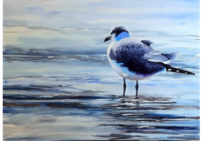
“Toes in the Water”