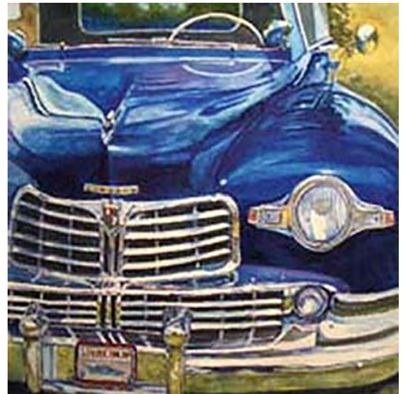
Clockwise from the top: Abbotts Mill Sheds , Hot Lincoln , and 2014 Eat In The Street by C. Mercedes Walls