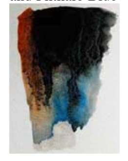
[Excerpted from watercolorweb.org.]