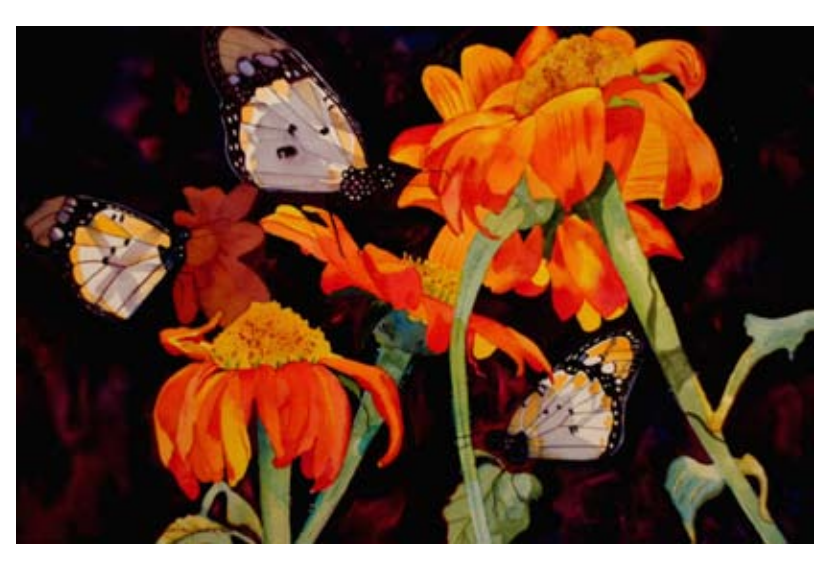
Motion in the Garden by Doris Davis-Glackin Second Place Biggs Museum