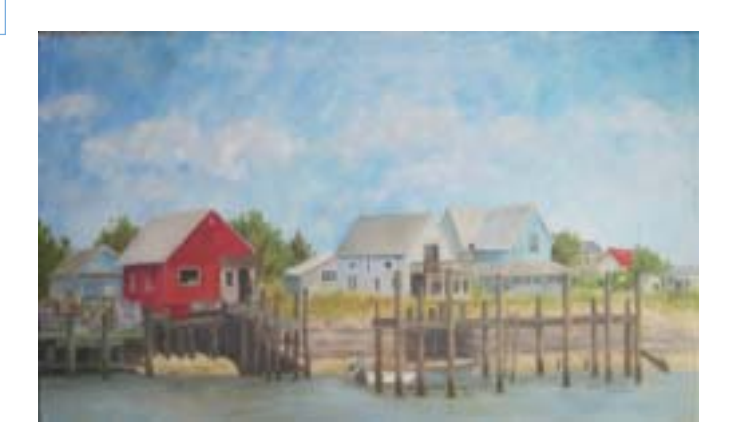
View from South Bowers Beach by Cathy Serwalt

The two-month show will be available for viewing through November. For more information, call (410) 208-4014.