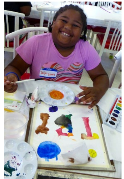
Just one of the smiles

Thrilled to see the kids and teens joyous while learning and exploring their creativity through watercolor. ...Kat Huston