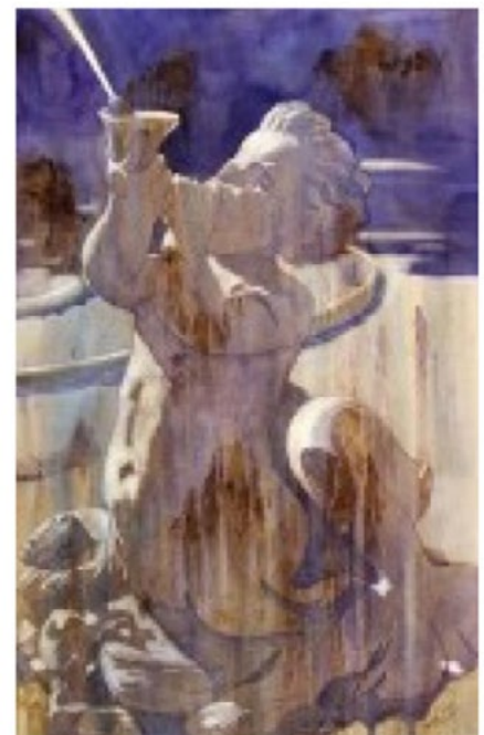
Water Sprite by Susan Avis Murphy

If you would like to participate, application forms, rules and regulations are at https://www.georgetowncoc.com/sites/default/files/Art%20Crawl%20Application.pdf