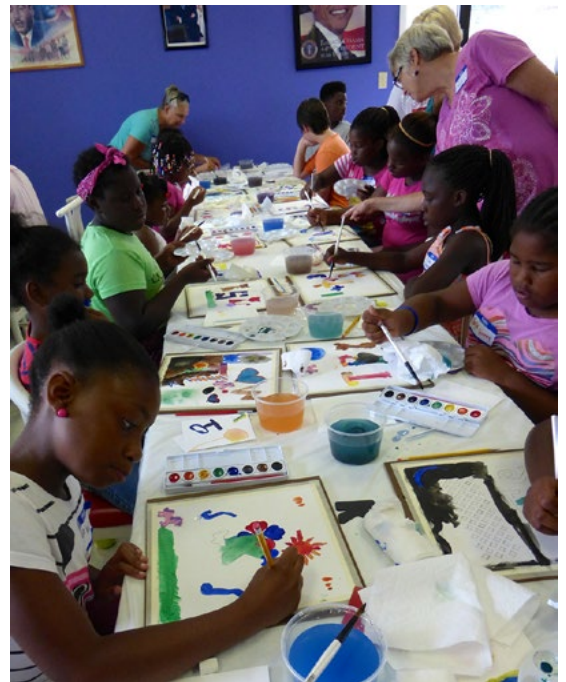
Helping with the Creative Process