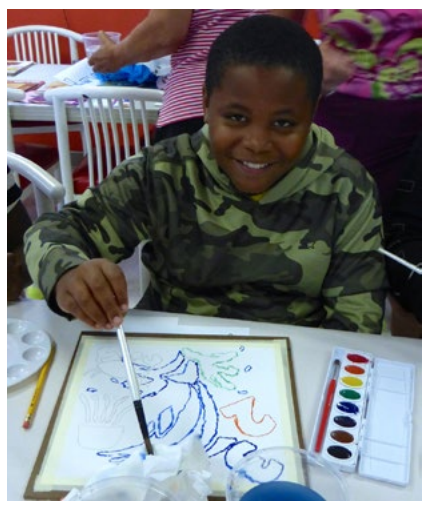
Big Smile... Big Fun

On July 24th, DWS volunteers brought the watercolor experience to the children of New Beginnings in West