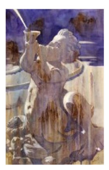
Water Sprite by Susan Avis Murphy

If you would like to participate, application forms, rules and regulations are at <u>https://www.georgetowncoc.com/sites/</u> default/files/Art%20Crawl%20Application.pdf