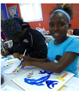
Concentration & Smiles

of watercolor paper, a pencil, eraser, water container, and support board. The students