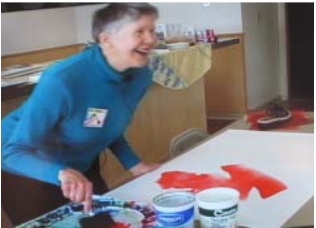
Cinca swoosnes on the pain