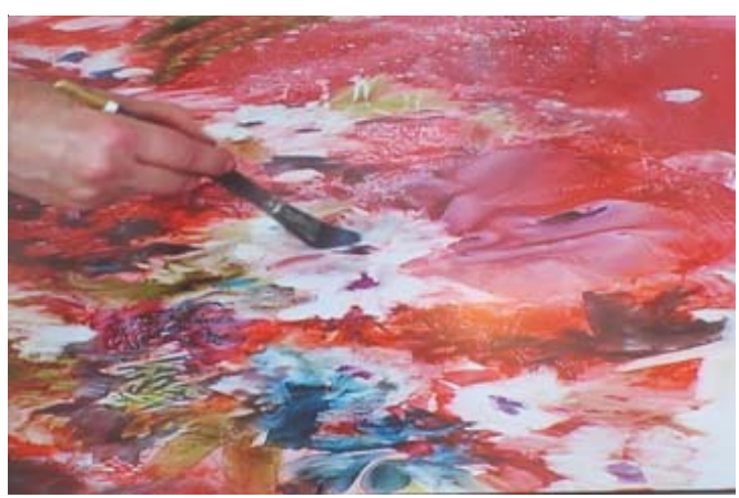
What brillant colors Chica gets on Yupo.

We had a full house for the Yupo workshop. Chica Brunsvold encouraged us to let go and play with watercolor on large sheets of paper. Brunsvold swirled and spashed colors on Yupo and then pulled out shapes and designs from the background to develop floral and animal-like compositions which she frequently embellished with calligraphic brushwork. A fun and expressive time with some lovely results.